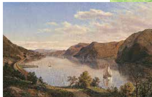
Charles Herbert Moore, Down the Hudson to West Point, 1861 , Frances Lehman Loeb Art Center, Vassar College

Designated a National Heritage Area by Congress, the Hudson Valley has more major historic sites per square mile than any other area in the United States. Fabulous mansions of the Gilded Age, quaint river towns, unparalleled hiking and climbing sites in the Catskills and the Shawangunks, world-class art museums – the valley is a national treasure. Poughkeepsie, Vassar's hometown, is half way between Albany, the state capitol, and New York City. The Vassar campus comprises over 100 buildings in architectural styles ranging from modernist to collegiate gothic and 1,000 picturesque acres ranging from the sweeping lawns of the main campus to the meadows and woodlands of the Vassar Farm. Main Building, designed by James Renwick Jr., and the Maria Mitchell Observatory are both National Historic Landmarks.