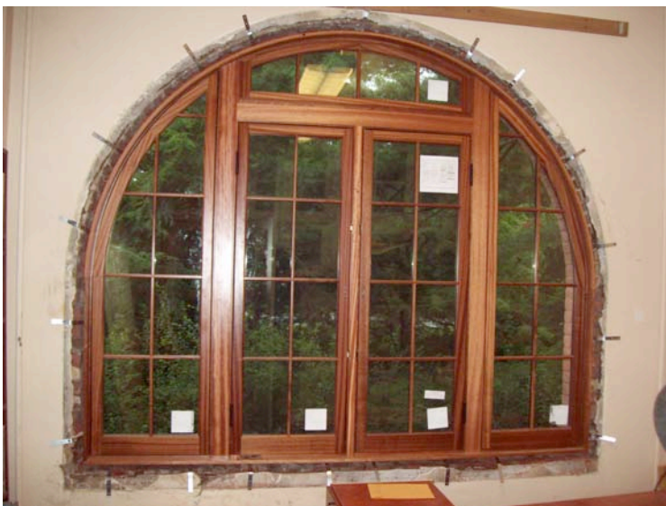
Below: All battened down, and ready for trim and finishing.