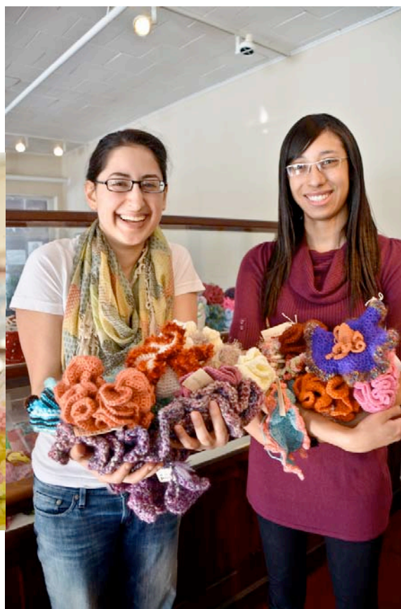
Above: The Arthropycus fossil. Below, some of the many crochet coral organisms crafted for the Vassar Hyperbolic Crochet Coral Reef.