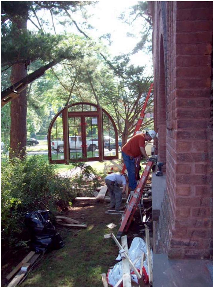
Upper right: The new windows delivered, in bulk.