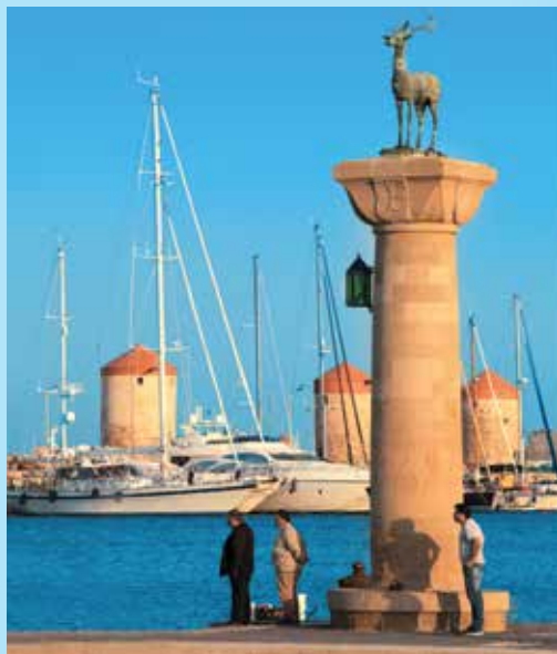
The bronze stag symbolizes the Colossus of Rhodes, one of the Seven Wonders of the Ancient World.