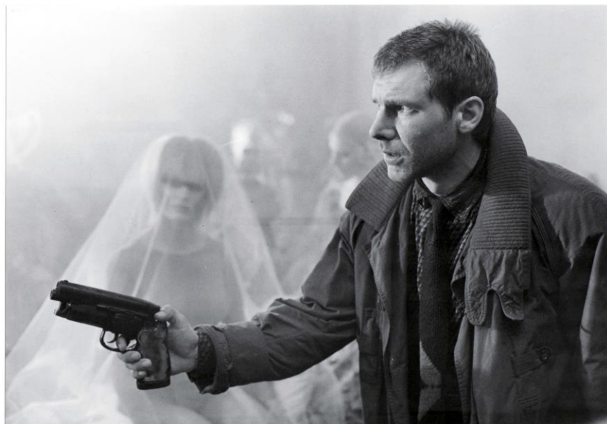
Harrison Ford in Blade Runner , 1982

LC: Do you think there is a flesh of language? Do you think different languages have a different flesh?