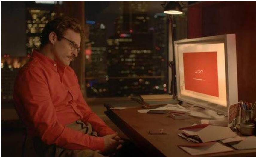
Joaquin Phoenix in Her , 2013

LC: In your new book, The Flesh of Images , you talk about the notion of visibility in relation to the flesh. Is your notion of visibility related to what you have just talked about, the co-constitution of these oppositional pairs?