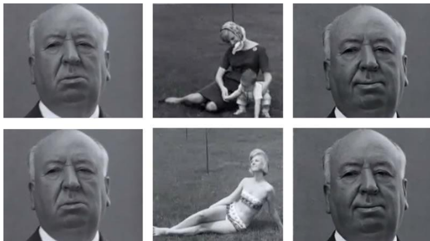
Alfred Hitchcock, The Kuleshov Effect