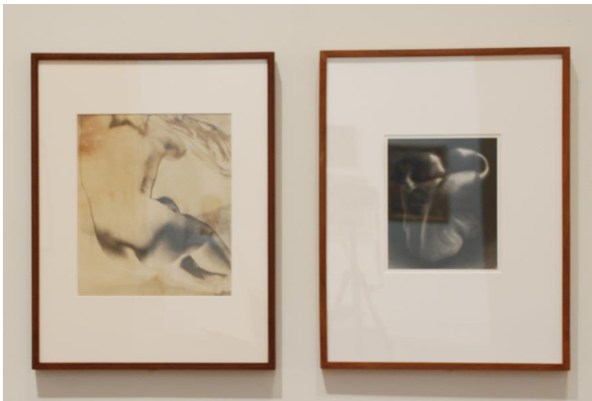
Konrad Cramer, Female Nude , 1939. Edward Weston, Pepper No. 30 ,

In our relationship with images there are many different temporalities at work simultaneously. The traditional idea, let us call it Platonistic, that first comes reality and then comes the image suggests that there is just one kind of temporality at work in our relationship with images. On the contrary, what we discovered on