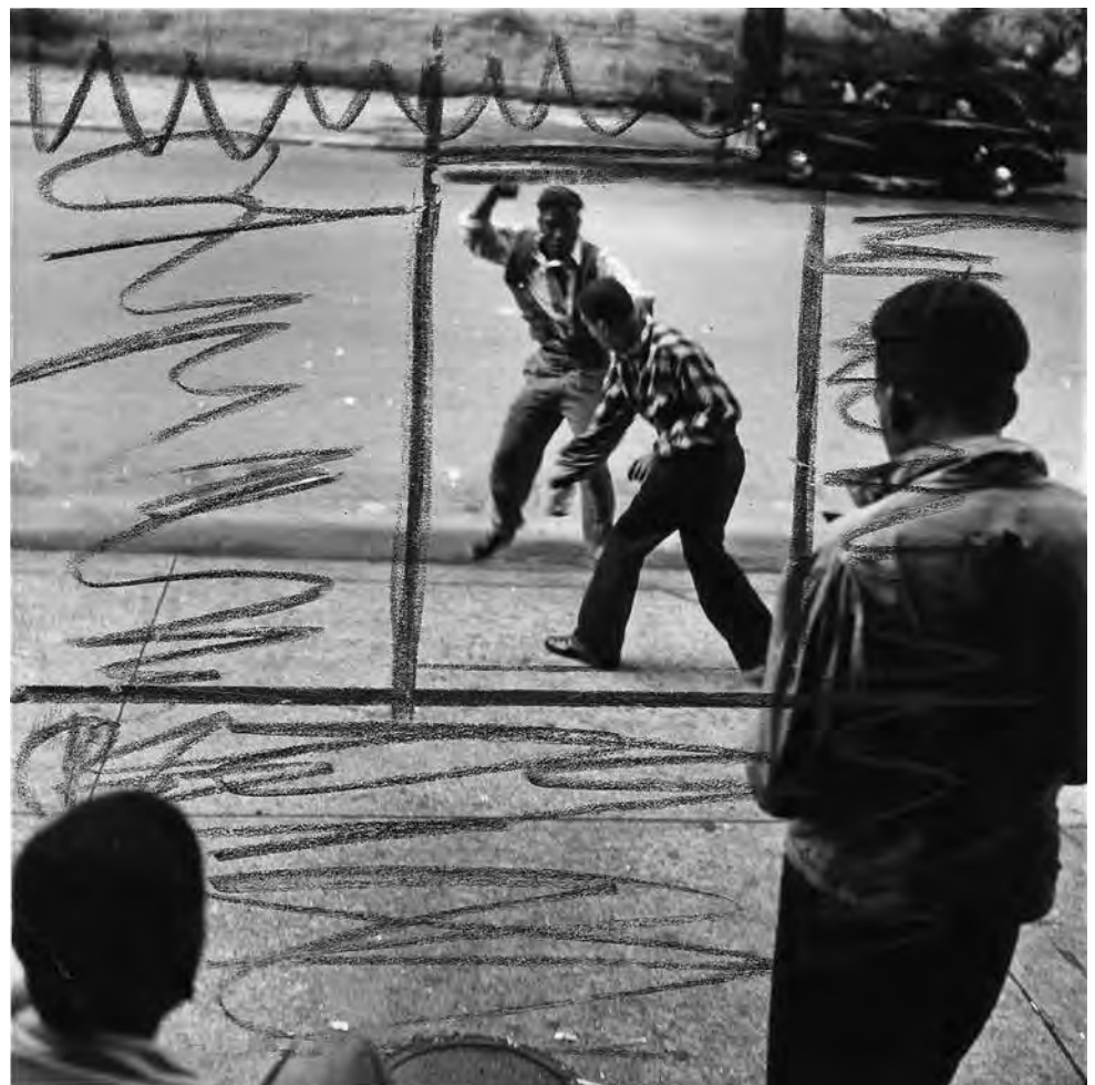
Gordon Parks (American, 1912-2006) Untitled, Harlem, New York, 1948 Gelatin silver print