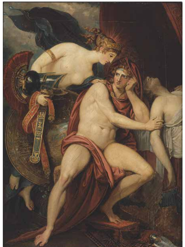
Benjamin West (American, 1738-1820) Thetis Bringing Armor to Achilles Oil on canvas Gift of Matthew Vassar, 1864.1.72