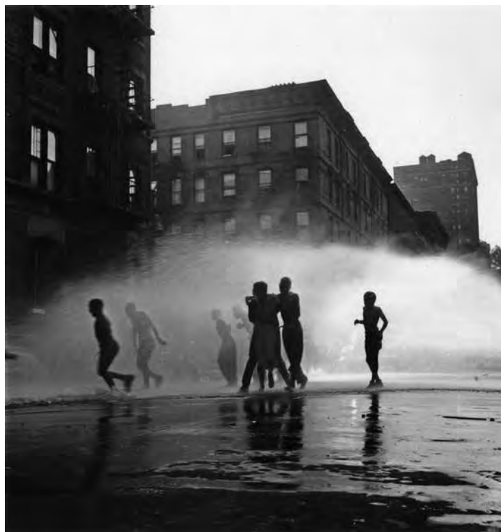
Gordon Parks (American, 1912-2006) Untitled, Harlem, New York, 1948 Gelatin silver print

During his time with these young gang members, Parks produced hundreds of images that are by turns artful, emotive, poignant, and sometimes shocking. From this body of work, the editors at Life selected twenty-one visually commanding photographs to reproduce in a graphic, adventurous layout in the magazine, often cropping or enhancing details in the pictures. The ten-page spread was the first of its kind to feature up-close images of inner city violence and the private and public lives of black youth. Many of the images showed Parks' emerging style for which he later became known, including acute angles, closely framed faces, and dramatic lighting. However, the intentions of the magazine and those of the artist did not always align. Parks hoped that his photographs would bring attention to