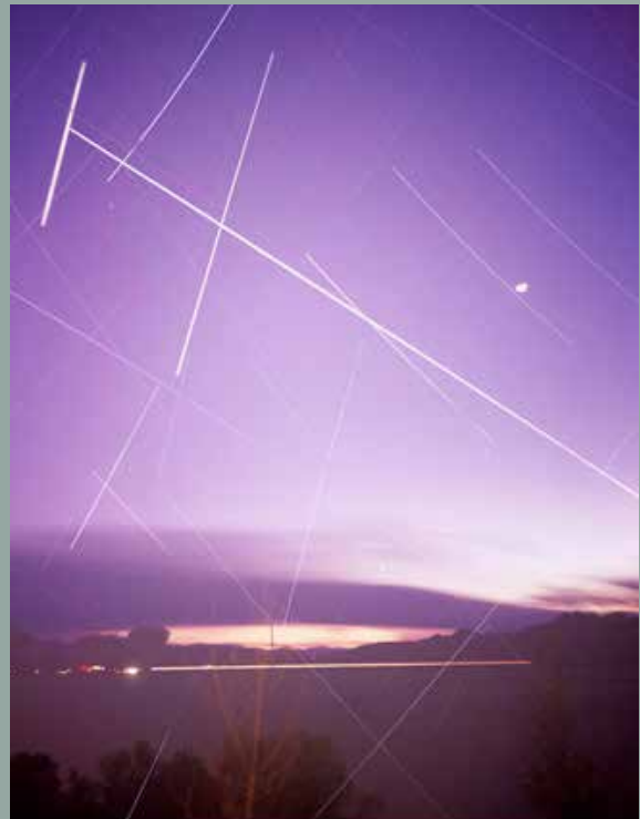
Sharon Harper (American) Moon Studies and Star Scratches, No. 11, Clearmont, Wyoming, 2005 Luminage print on Fuji Crystal Archive paper, mounted

Celebrating Heroes: American Mural Studies of the 1930s and 1940s from the Hirsch Collection September 2 – December 18, 2016