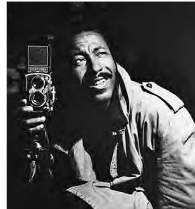
Gordon Parks (American, 1912-2006) Self-Portrait, ca. 1948 Gelatin silver print