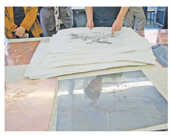
Members viewing the many steps of the printmaking process.