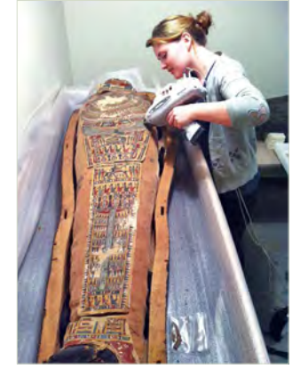
Student Julie MacDonald, class of 2012, uses an XRF spectrometer to analyze pigments on a mummy cartonnage.