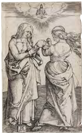
Albrecht Dürer (German, 1471-1528) The Virgin with the Infant Christ and St. Anne , ca. 1501 Engraving on paper 5 5/8 x 2 13/16 inches Gift of Matthew Vassar 1864.1.320