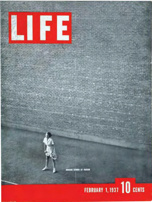
Life Magazine February 1, 1937 cover

The cover of the February 1, 1937 issue of LIFE magazine featured a black-and-white photograph of a brick wall and at the lower left corner stands a female figure dressed in tennis whites, holding a racket at the ready next to a small caption reading “Indoor Tennis at Vassar”. Inside, a seven-page feature entitled “Vassar: A Bright Jewel in U.S. Educational Diadem” was generously illustrated with twenty-five delightfully compelling photographs by Albert Eisenstaedt. While much has changed on campus since 1937 when tuition was $1,200, breakfast was at 7:30am and curfew at 10:30pm, Vassar still remains a fascinating subject for fine art photographers. Evidence of this fact will be on view this spring in an exhibition entitled 150 Years Later: New Photography by Tina Barney, Tim Davis, and Katherine Newbegin . The exhibition opens in January with the reopening of the Art Center and the kick-off for sesquicentennial events across campus and beyond.