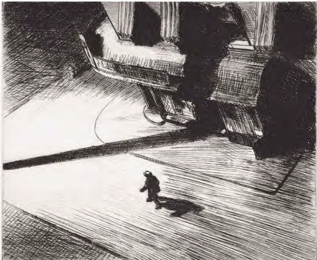
Edward Hopper, (American, 1882-1967) Night Shadows , 1921 Etching on paper 13 7/16 x 16 1/8 inches Gift of the Art Club 1928.2