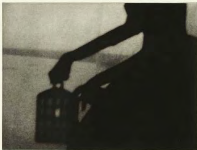
Kara Walker (American, b. 1969) Testimony (Woman holding a lantern), 2005 1 of 5 photogravures on Hahnemuhle paper; edition 15/20 Purchase, Horace W. Goldsmith Foundation Fund, 2009.25.1

The Art Center's first acquisition of work by internationally recognized artist Kara Walker, Testimony , has proved to be of great interest to students, faculty, and our general audience.