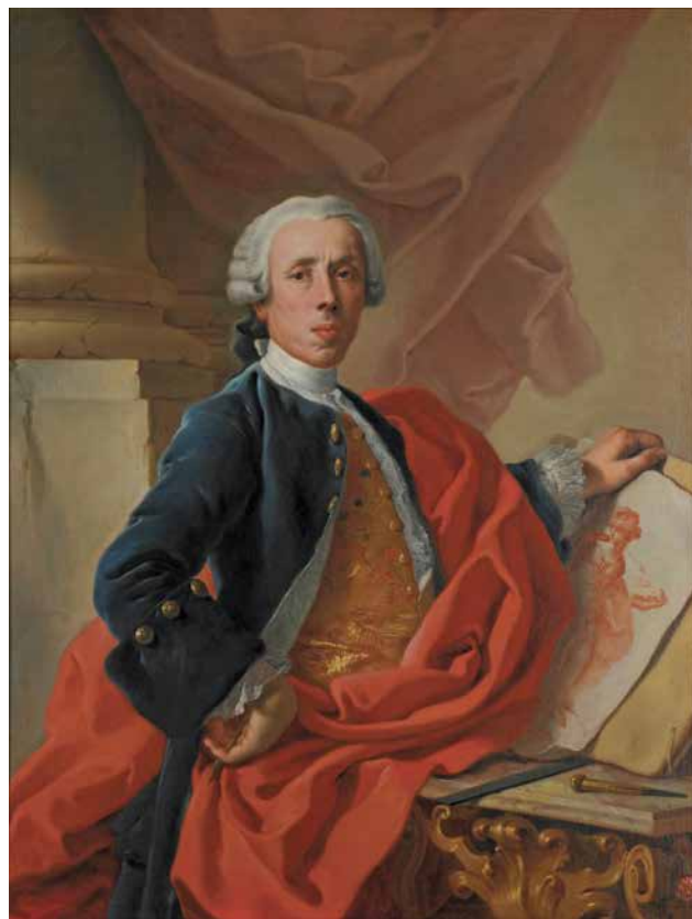
Francesco de Mura ( Italian, 1696–1782) Self-portrait , ca. 1740 Oil on canvas The Minneapolis Institute of Arts, purchased with funds from the John R. Van Derlip Fund, acc. no. 62.48

De Mura's early paintings before 1730 are largely driven by the inherent drama of moments from the accounts of Christ's Passion such as the two paintings of the Ecce Homo (Christ Shown to the People after his arrest); the Pietà ; and the