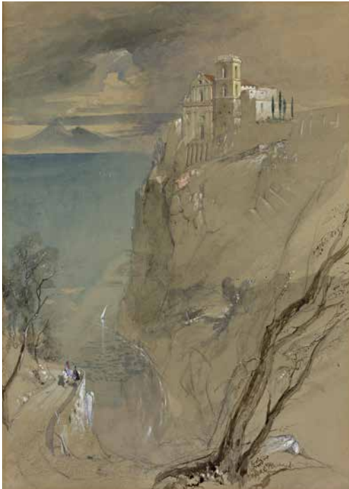
John Ruskin (British, 1819–1900) Church of the Annunciation at Vico Equense on the Bay of Naples, 1841 Watercolor over charcoal on blue-gray paper Gift of Matthew Vassar 1864.1.206