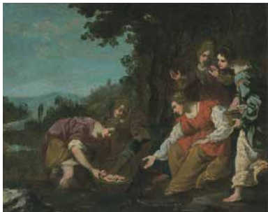
Jacopo Vignali (Italian, 1592-1664) The Finding of the Infant Moses Oil on canvas Museum purchase, 1937.4