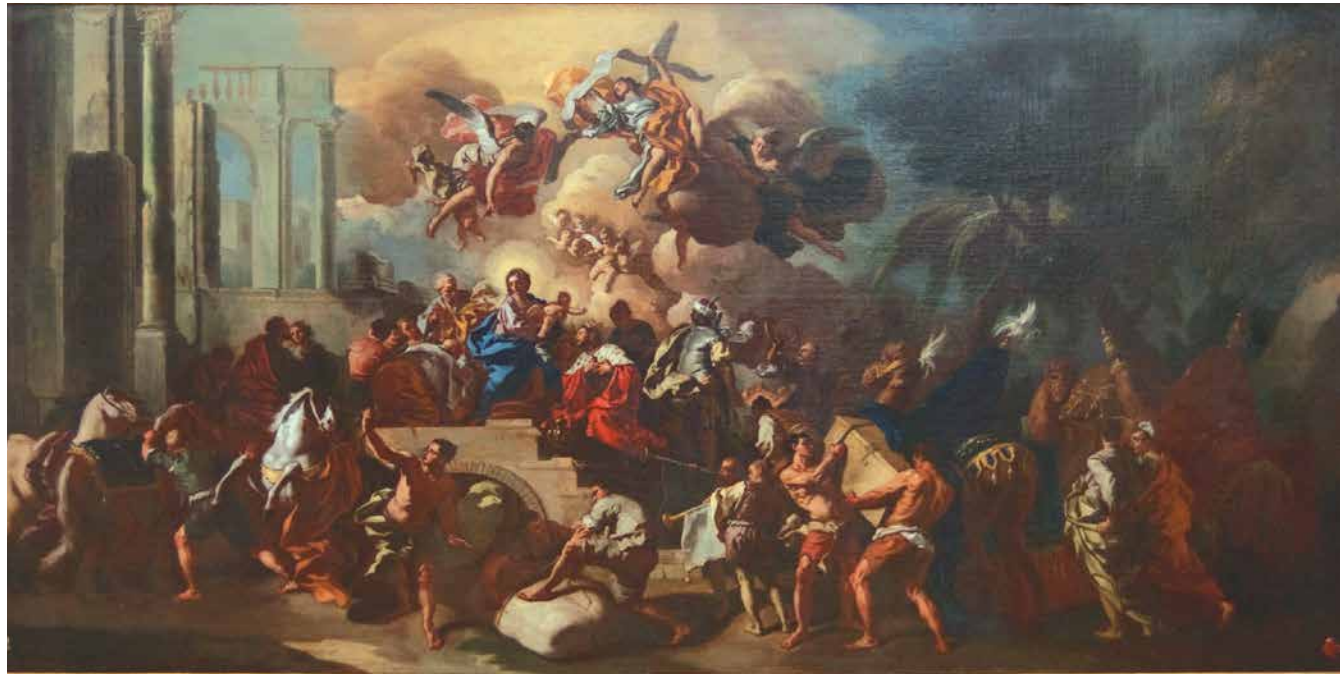
Francesco de Mura (Italian, 1696–1782) Adoration of the Magi (Epiphany) , 1732 Oil on canvas Pio Monte della Misericordia, Naples, inv. no. 101

The mature works after 1730 take on a more grand and operatic nature and style as the artist begins to separate himself from the artistic personality of his mentor Solimena. The Adoration of the Magi , a relatively large (42 x 83 inches) oil sketch for an even larger painting frescoed in the curved section of the apse behind the altar in the church of the Nunziatella (the military academy) in Naples is just such a work. A visual tumult surrounds the Holy Family as muscular porters wrangle heavy chests of gifts, horses and camels twist and turn in agitation, and airborne angels cling to clouds and banderoles. All these motives signal a definite break with the more sober early work and a brightening and lightening of the artist's palette suggests the nascent influence of French Rococo style. The holy figures themselves are threatened with being overwhelmed by the