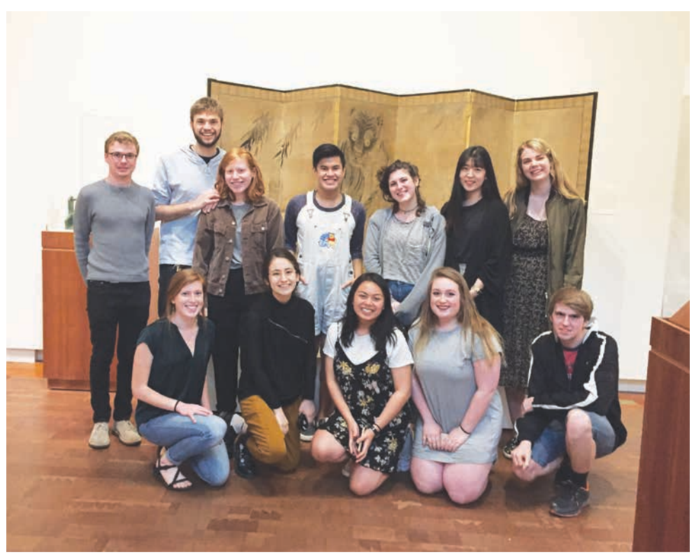
Students in Art 218 gather in front of a seventeenth-century Japanese folding screen in the Menagerie in the Museum exhibition.