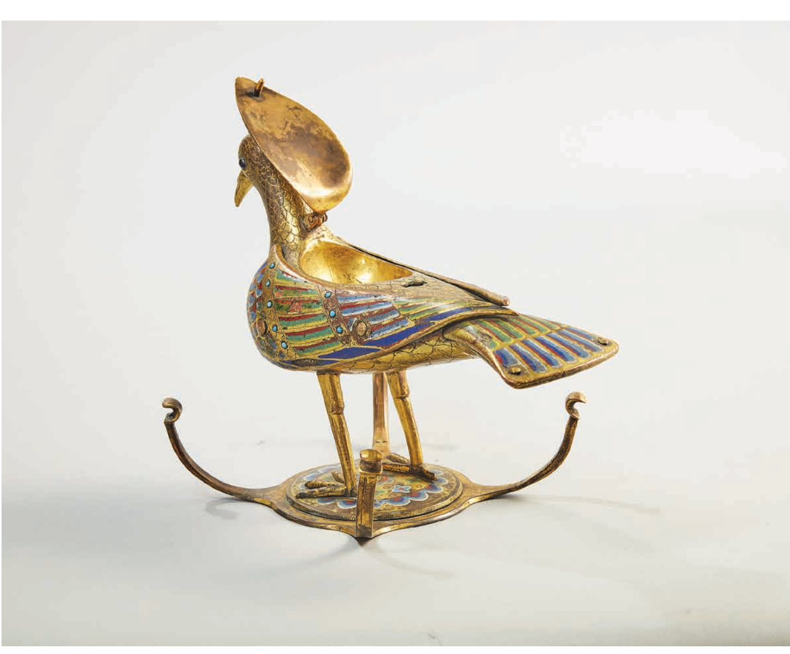
The gilded compartment on the back of the Limoges Eucharistic dove