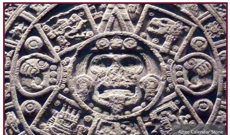
Aztec Calendar Stone