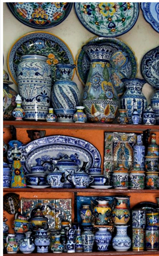
Talavera Shop, Puebla

Spend the morning at awe-inspiring Monte Albán, the ancient Zapotec capital. This archaeological site features a ceremonial plaza as well as a ball court, observatory, various tombs, and several temples. Continue to San Antonio Arrazola, home of the internationally famous Oaxacan