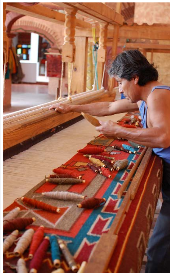
Weaver in Oaxaca