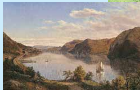
Charles Herbert Moore, Down the Hudson to West Point , 1861, Frances Lehman Loeb Art Center, Vassar College

Designated a National Heritage Area by Congress, the Hudson Valley has more major historic sites per square mile than any other area in the United States. Fabulous mansions of the Gilded Age, quaint river towns, unparalleled hiking and climbing sites in the Catskills and the Shawangunks, world-class art museums – the valley is a national treasure. Poughkeepsie, Vassar's hometown, is half way between Albany, the state capitol, and New York City. The Vassar campus comprises over 100 buildings in architectural styles ranging from modernist to collegiate gothic and 1,000 picturesque acres ranging from the sweeping lawns of the main campus to the meadows and woodlands of the Vassar Farm. Main Building, designed by James Renwick Jr., and the Maria Mitchell Observatory are both National Historic Landmarks.