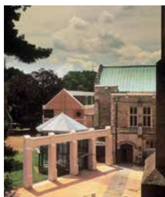
The Frances Lehman Loeb Art Center contains one of the finest college collections in America.

Innisfree Garden 362 Tyrrel Road, Millbrook, NY 150 acres of gardens, streams, waterfalls, terraces, walls, rocks, and plants that merges the essence of Modernist ideas with traditional Chinese and Japanese garden design principles. innisfreegarden.org 845-677-8000